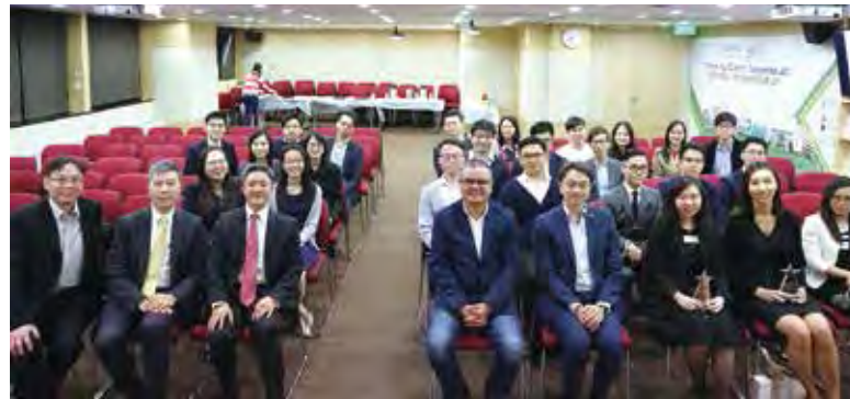
The GPD Council welcomes the new Members and Probationers