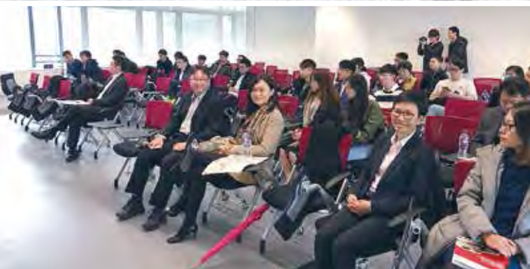
Career-Sharing Sessions with THEi Students