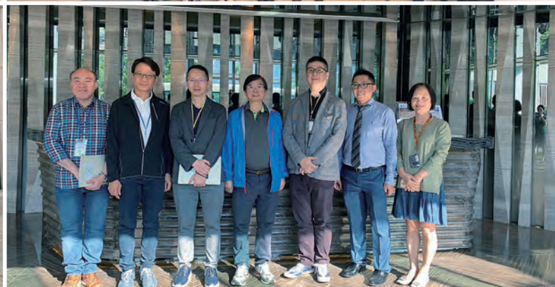
Quality Property and Facility Management Award 2018