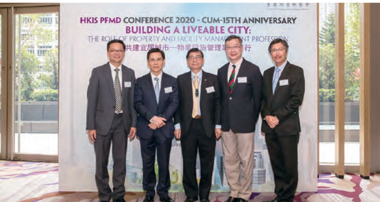
HKIS PFMD Annual Conference 2020-cum-15th Anniversary