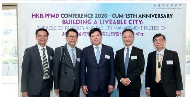
HKIS PFMD Annual Conference 2020-cum-15th Anniversary