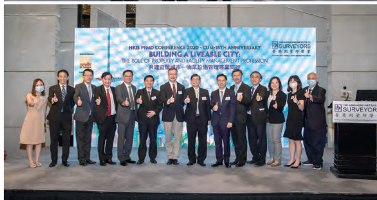
HKIS PFMD Annual Conference 2020-cum-15th Anniversary