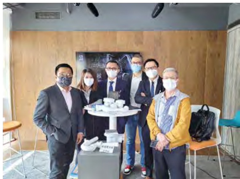
Behind the scene