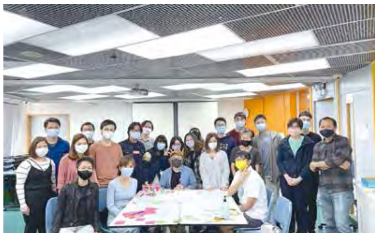
Community Outreach: Modular Sham Shui Po Co-creation Workshop for Vacant Land on Yen Chau Street