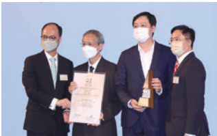
Merit Award Chinese University of Hong Kong Medical Centre (Rider Levett Bucknall Limited)