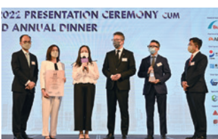
Silver Award Central Market (Rider Levett Bucknall Limited)