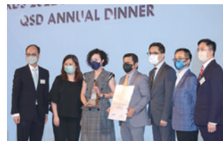
Merit Award St. Paul's College Alteration & Additional Works (Arcadis Hong Kong Limited)