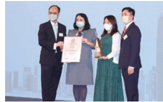
Merit Award Student Residence at Wong Chuk Hang Site for the University of Hong Kong (Beria Consultants Limited)