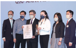
Merit Award Public Rental Housing Development at Anderson Road Sites A & B Phases 1 and 2 (Yau Lee Building Construction & Decoration Co, Ltd)