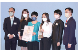
Gold Award The Hang Seng University of Hong Kong New Academic Building Project (Rider Levett Bucknall Limited)