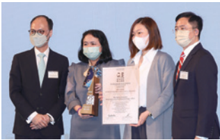
Merit Award Hong Kong Science Park Expansion Stage 1 (SPX1) (Beria Consultants Limited)