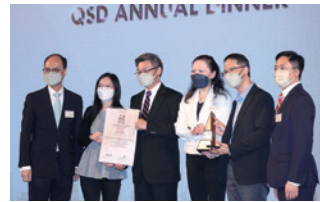
Silver Award Private Residential Development of L Living 23 (L23) (Yau Lee Building Construction & Decoration Co, Ltd)