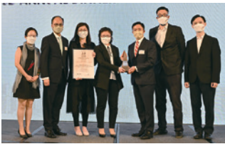
Bronze Award Temporary Quarantine Facilities at Penny's Bay Phases 1B, II, IIIA, & IIIB (Architectural Services Department)