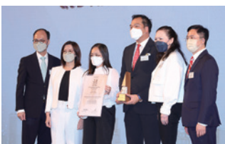
Gold Award Hong Kong Sanatorium & Hospital Eastern Medical Centre Tsao Yin Kai Block (Rider Levett Bucknall Limited)