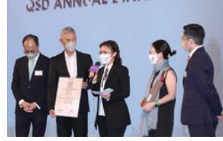
Bronze Award Reprovision of Fu Shan Public Mortuary at Shatin (Architectural Services Department)