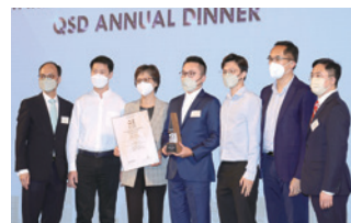
Merit Award Grand Victoria (China Overseas (HK) Limited)