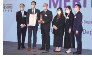
Merit Award Disciplined Services Quarters at Fire Services Department in Pak Shing Kok (Architectural Services Department)