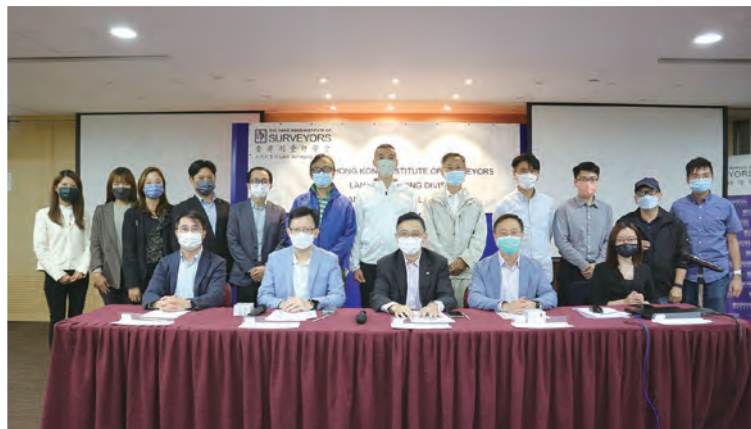
Caption: Newly elected LSD Council 2022-23