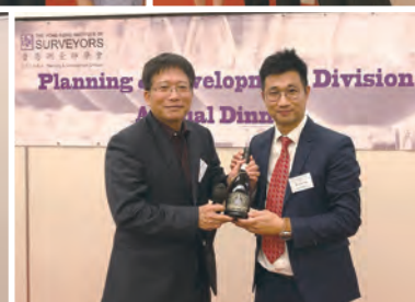
PDD Annual Dinner 2022