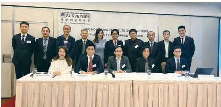
PDD Annual General Meeting with Council Members and Co-opted Members