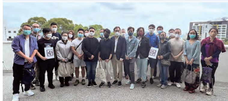
Members Outside the Shaw Auditorium