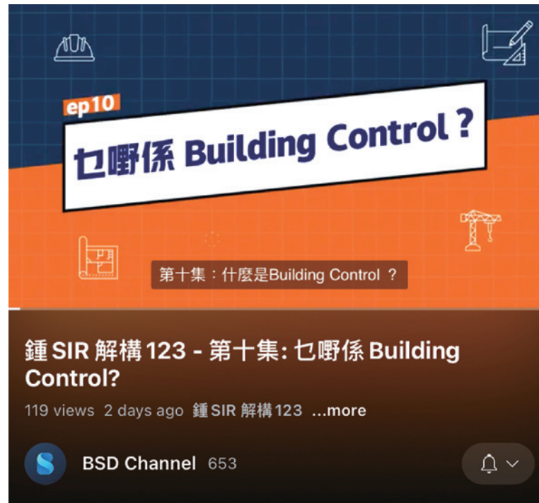
BSD Youtube Channel

Meanwhile, the team also needs more helpers to support future channel content productions, so members who are interested in joining it should contact me.