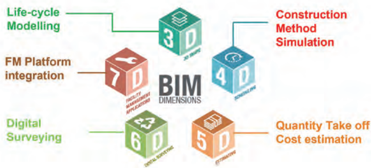
Figure 1: BIM Dimensions

Later, Mr Ng presented examples of BIM functions and how BIM supported 4D construction simulation, automatic drawing generation, 3D design reviews and coordination, 5D quantity takeoff and digital surveying, etc. He also introduced an online platform for BIM models that construction professionals could consult to support their work.