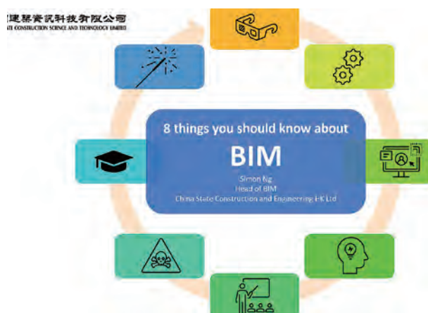
Figure 2:8 Things You Should Know about BIM