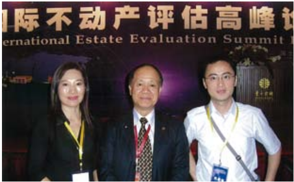
Joint Professional Events - Guangzhou Trip for Property Professionals on 7 July 2008

PDD has actively taken part in many joint professional events. In July 2008, at the invitation of the professionals of the Architectural, Surveying and Planning Functional Constituency, we joined a trip to Guangzhou and had liaison with officials, professionals and mainland developers to exchange views and explore business and co-operation opportunities in Guangzhou and Pan-Pearl River Delta. Enhanced CEPA arrangements were also discussed.