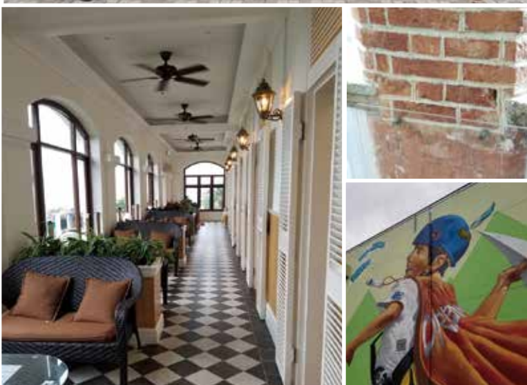
Group Site Inspections and Knowledge-Sharing with HKU Students

傑出建築測量師已開始接受提名，截止時間為 5 月 31 日下午 6 時正，會員可於學會網頁下載提名表格，提名業內合符資格及對建築測量行業有顯著貢獻的建築測量師。