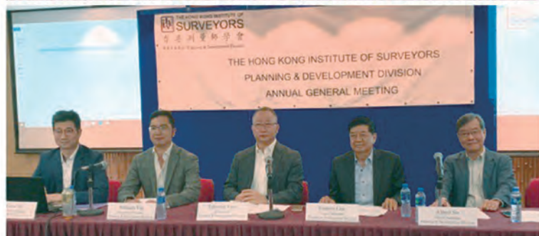
PDD Annual General Meeting