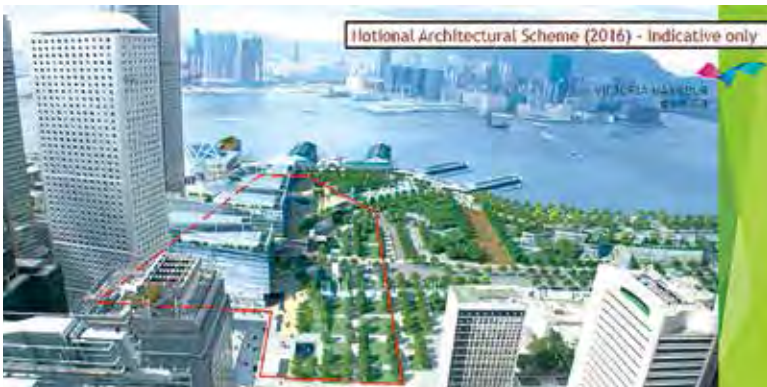
Photomontage of the Notional Architectural Scheme with Site 3 Bounded by a Red Dotted Line (Extracted from the Presentation Material for the 37th Meeting of the Harbourfront Commission on 5 May)

A PDD research proposal titled, "Market Research for Hong Kong Planning and Development Surveyors in Belt and Road Countries: Case Studies of Vietnam, Thailand, and Malaysia," has been submitted to the HKIS Research Committee. This study will provide insights into the planning and development surveying industries and show how surveyors can enter the markets of Belt and Road countries.