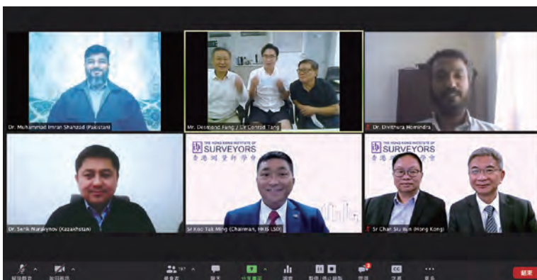
Speakers from the Four Belt and Road Countries