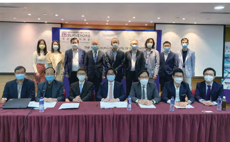
PDD Members at the PDD AGM 2020

The PDD Annual General Meeting was held on 12 November at the SLC. With over 15 corporate members in attendance, the PDD office bearers presented the PDD Council's annual report and answered questions from members.