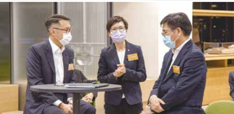
“Let’s have a Chat about BIM” by ArchSD