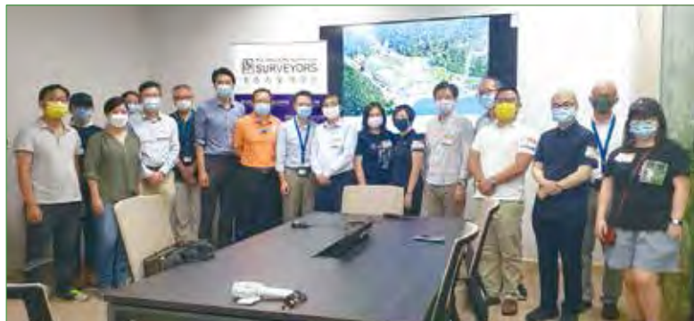
Group Photo Taken Inside the VIP Meeting Room at Water World