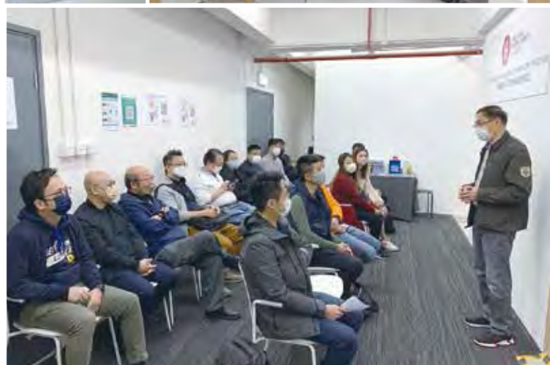
Two visits to the Hong Kong Housing Society's Accessible and Adaptable Design Mock-up Flat Prototypes (4 December)