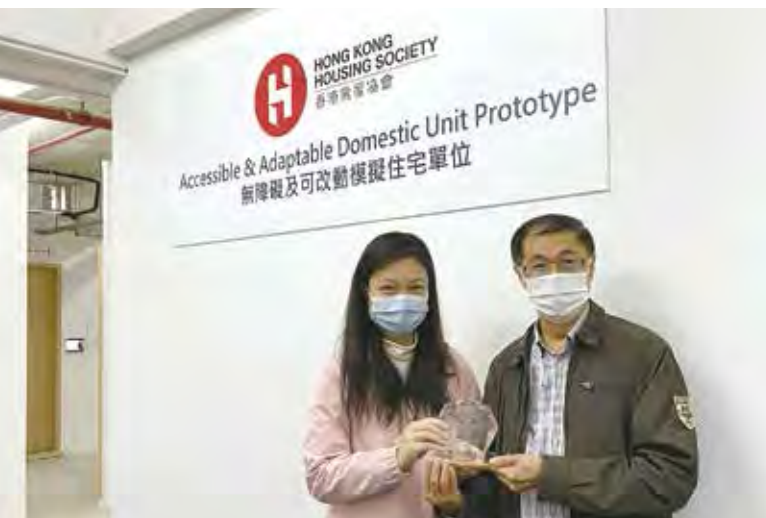
Two visits to the Hong Kong Housing Society's Accessible and Adaptable Design Mock-up Flat Prototypes (4 December)