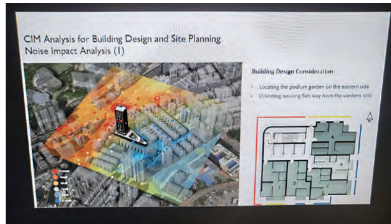
Tai Kok Tsui Renewal Project