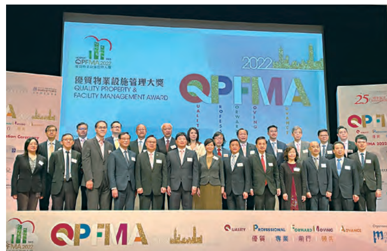
Organising Committee Members and Jurors