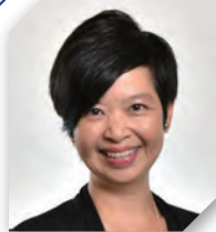
何永贤女士，太平绅士 香港特别行政区房屋局局长