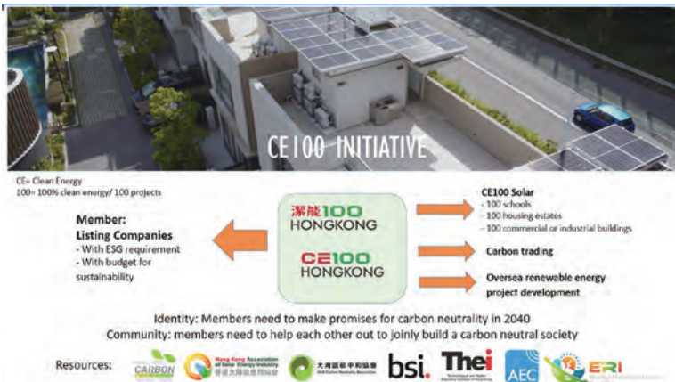
Figure 1: Core CE100HK Initiatives

a number of leading corporations and financial institutions that are inaugural members of the Hong Kong International Carbon Market Council, which allows them to explore carbon opportunities in the region. The third initiative specialises in expediting carbon neutrality through the construction of solar farms locally and worldwide.