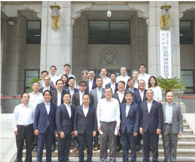
Group Photo of the HKIS Delegation and HKIS Beijing Members Outside the 國家住房和城鄉建設部 Office

The PFMD also took this opportunity to promote its Annual Conference on 22 September 2023, which will cover the next generation of smart property and facility management in the Greater Bay Area.