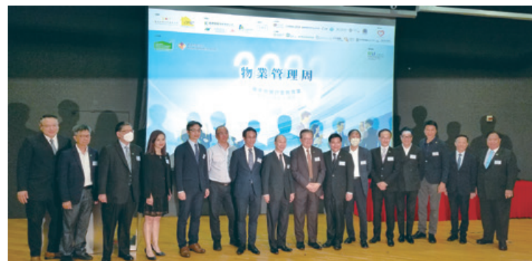
Group Photos of Event Hosts and Speakers