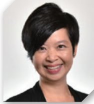
Ms Winnie HO Wing-yin, JP Secretary for Housing, HKSAR