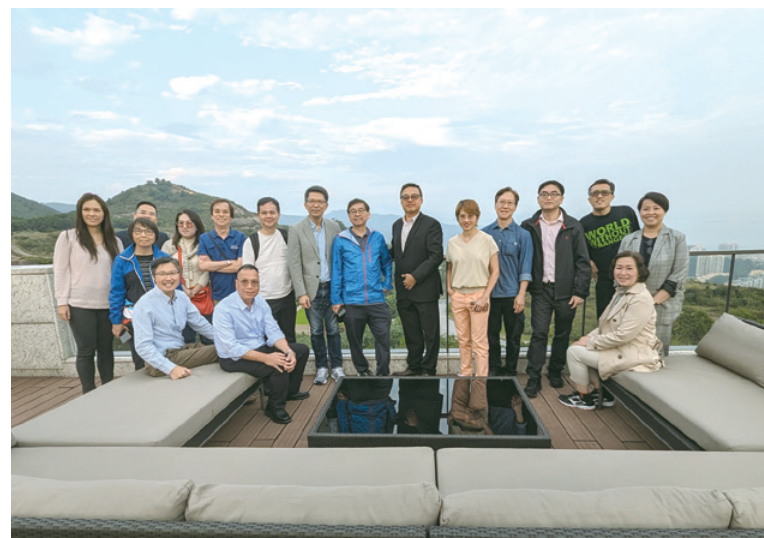
PFMD Surveyors on the Roof of a Luxury Show Flat