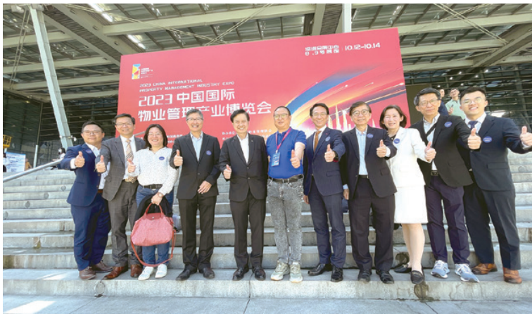
Visiting Tour Group Photo

Fourteen PFMD surveyors joined a group tour of the unique facilities in Discovery Bay on 14 November. The delegation first boarded a vessel, which doubled as a “floating classroom,” and learned about the past, current, and future development of this corner of Lantau Island. Members also had the opportunity to learn how to be captains. Then they went to a hotel stable to see a horse and try to manage it. They visited “Green Icon” to learn about the process of solid waste classification, farming, greenhouses,