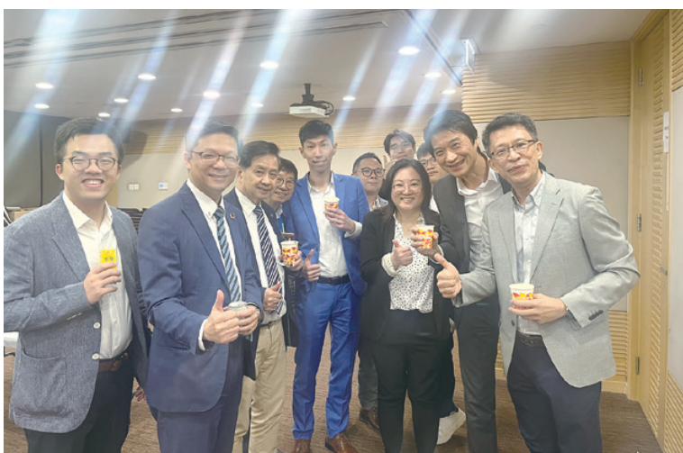
AGM Participants at the Drinks Gathering

The AGM concluded with a small drinks gathering, during which members thoroughly enjoyed and took the opportunity to socialise with each other and exchange knowledge and experiences. The party ended at about 8:30 pm.