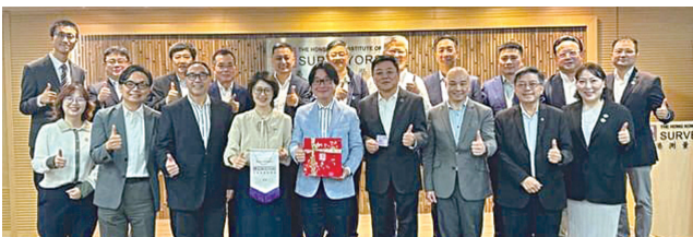
Building cooperation: the Shanghai Construction Consultants Trade Association delegation consisted of industry experts and young professionals, for whom we were happy to demonstrate HKIS methods of training, industry self-discipline and professional development. 互相合作：上海市建設工程諮詢行業協會代表團由一眾行業專家和年青專業人士組成，我們很高興能夠向他們展示香港測量師學會的培訓方式、行業自律制度和專業發展方向。